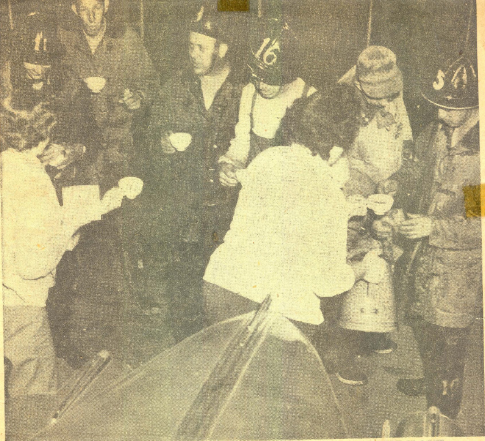
WOMEN VOLUNTEERS SERVE HOT COFFEE TO FIREMEN AFTER BATTLE IS LOST